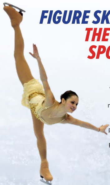
FIGURE SKATING IS ONE OF THE MOST POPULAR SPORTS IN THE U.S.

U.S. Figure Skating is in the top 5 of the most impactful NGB sponsorship opportunities.